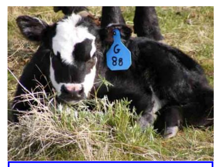
Notice this calf is wearing an ear tag. This helps ranchers to identify and keep records of all the cows and calves they have in their herd.