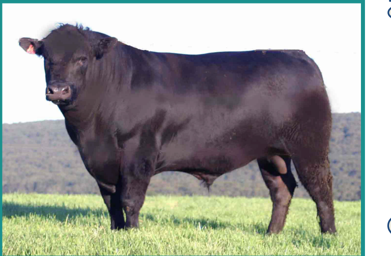
This is an angus bull. He will produce calves that will be used for either replacement stock or beef.