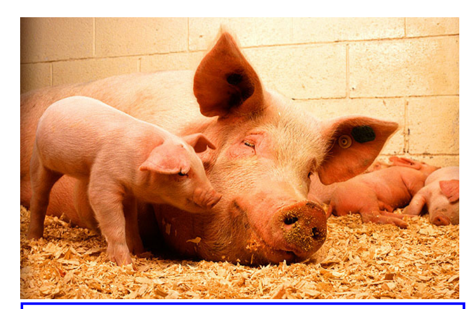
This sow has just given birth to her piglets. A sow is a female hog who has given birth.