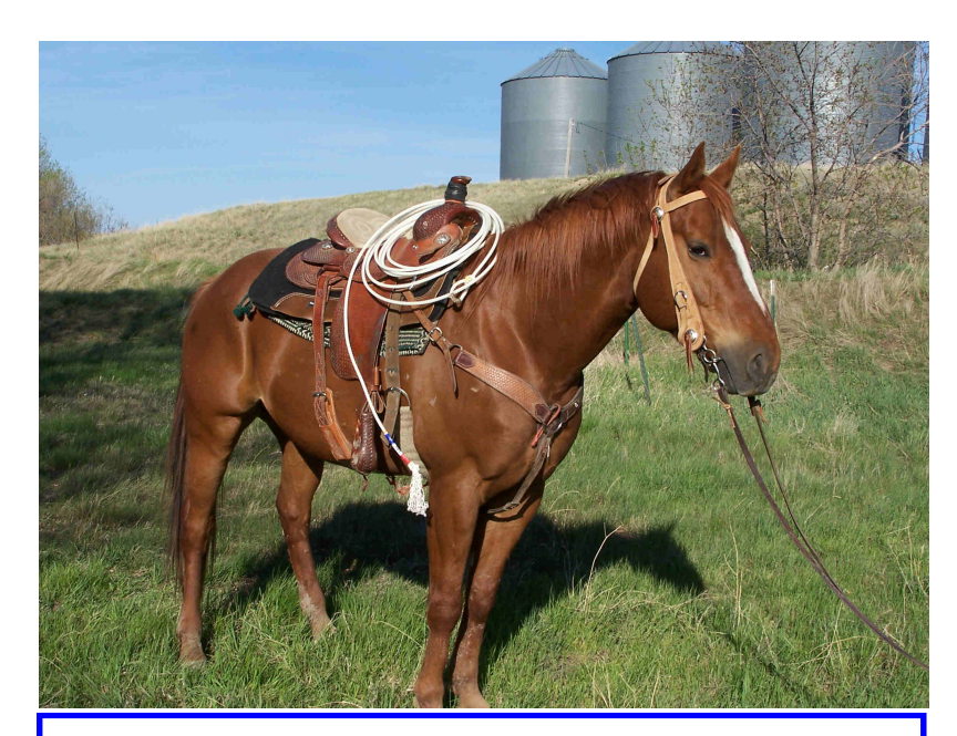
Many farmers and ranchers like to ride geldings. A gelding is a castrated male horse.