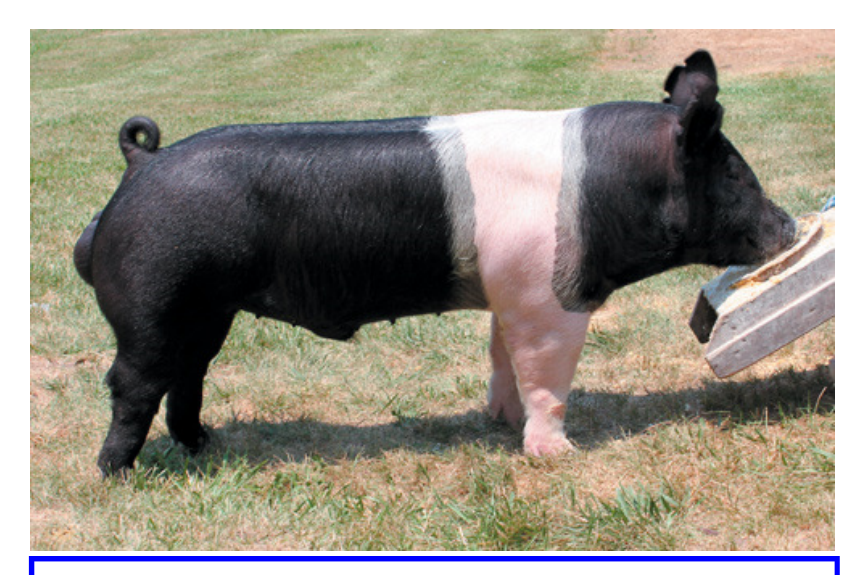
Here is a young boar. He will produce offspring that will one day be used for a variety of different commodities.