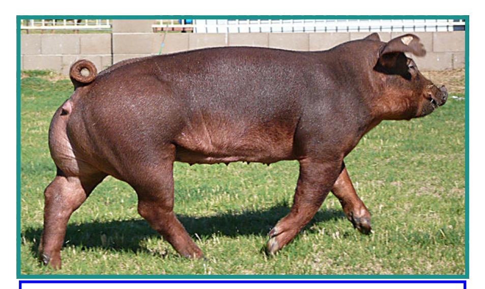
This young female pig is known as a gilt. She has not given birth to any piglets.