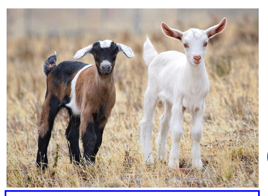
These young goats are called kids.