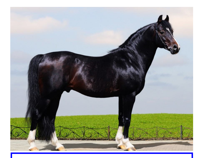
A stallion is an intact male horse.