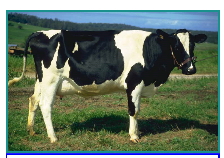
This breed of dairy cow is called a Holstein. They are the most popular dairy breed in the United States.