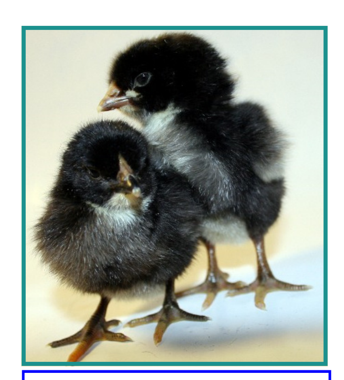
These chicks took 21 days to hatch out of their eggs.