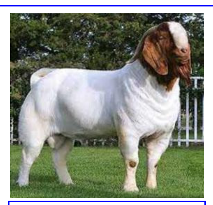
This breed of meat goat is called "Boer." He is male, so he's referred to as a buck or a billy.