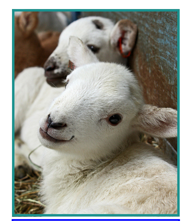
Lambs are old enough to be weaned at 2-3 months of age.