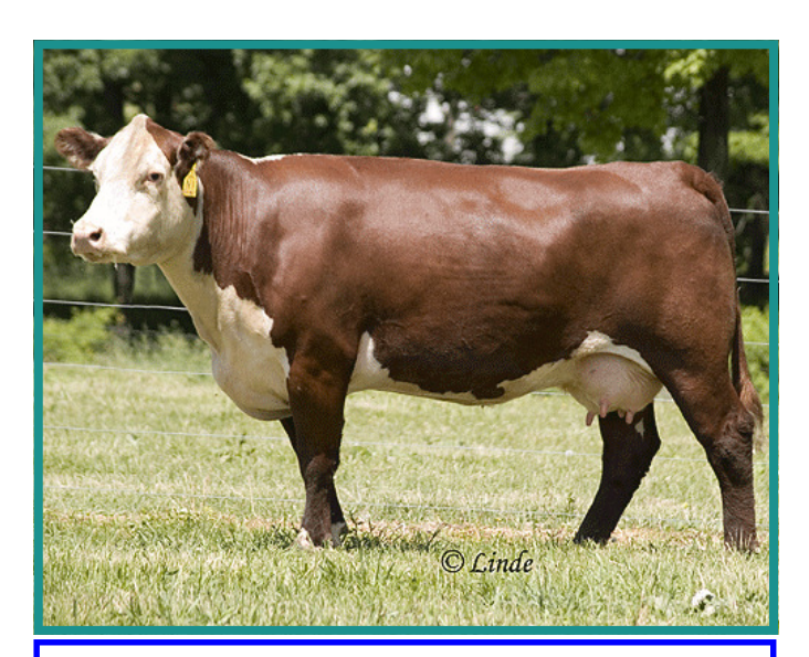
This female cow is a beef breed called "Hereford." She will have a calf every year.