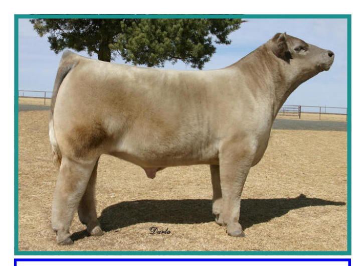
This steer will be used for high value cuts of meat. A steer is a castrated bull.