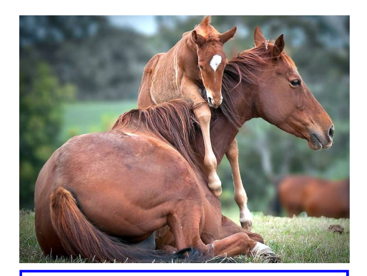
A newborn horse is called a foal. A male is referred to as a colt, and a female is called a filly.