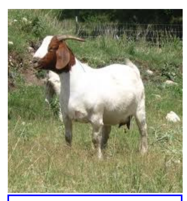
This doe, or nanny, is a meat goat. Her offspring will provide meat for many people to eat.