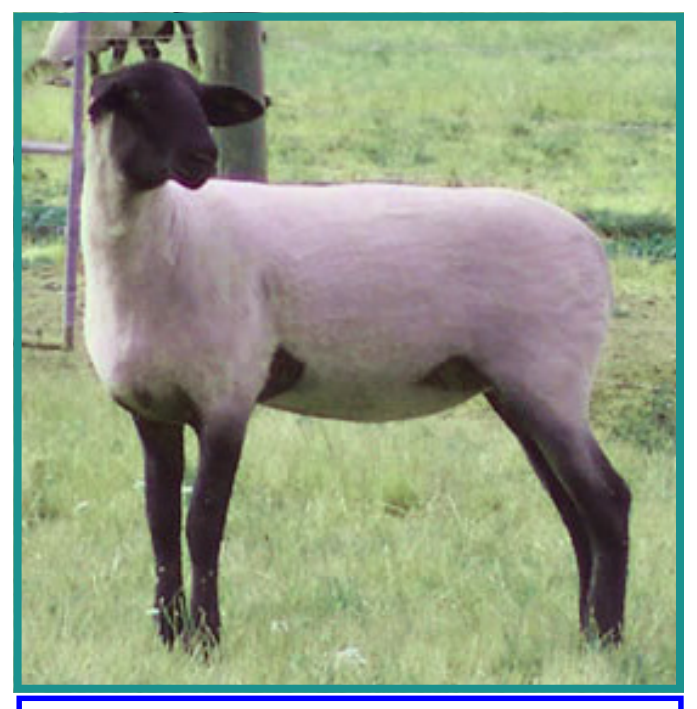
A female sheep older than one year is known as a ewe. A ewe can have one to three lambs per litter.

The mature weight of a ram, depending on the breed, ranges from 150 to 450 pounds. A ram is an intact male sheep. A castrated male is called a wether.