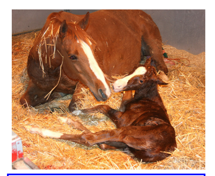
This mare has just given birth to a foal. She was pregnant with it for 11 months.