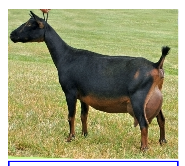
This doe is a dairy goat. She produces milk.